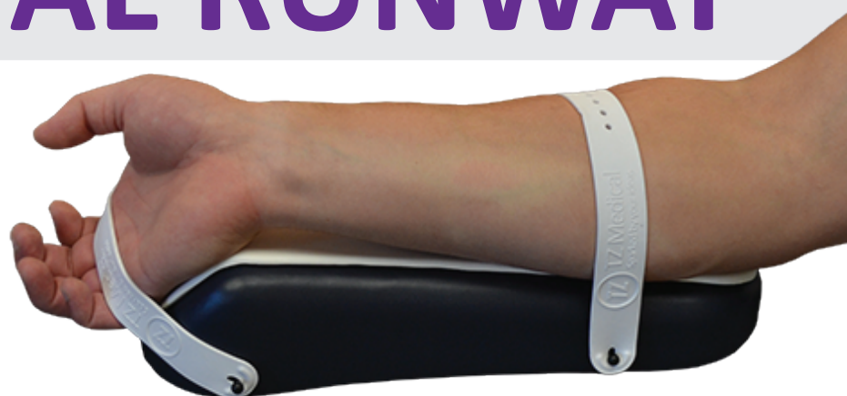
Radial Runway Reusable Base: Item# RRU-0008 Disposable Top Pad: Item# RRU-0009

Can be used on either side for radial access along with the TZ Medical Flat Radial Board. (Shown below.)