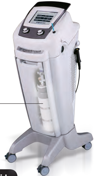
CO 2 Cylinder inside