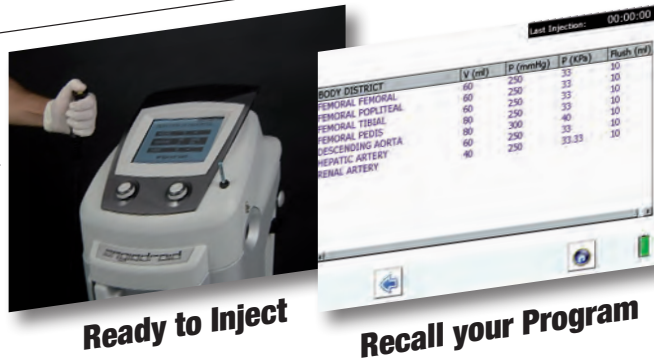
Ready to Inject